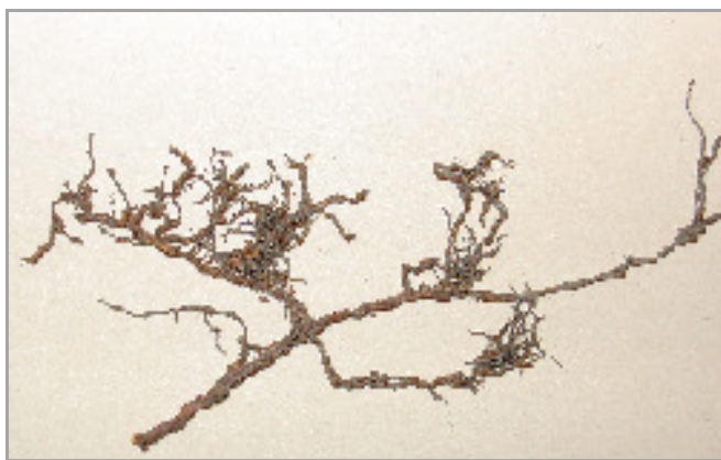
Figure 1: Root damage caused by ring nematode

Nyczepir et al. , (1987) found that ring nematode decreased the reducing sugars (glucose) in the roots of peaches. Glucose is the primary source of energy for a plant cell. Insufficient glucose in turn predisposes the peach tree to injury from environmental and biological stresses such as bacterial canker. The same could possibly be true for vines.